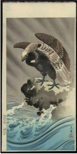
Figure 2: Original artwork by Tsuchiya Koitsu, who was famous for his landscape art. Misclassified as Kono Bairei, who was famous for his artworks depicting birds and flowers.