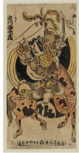
Figure 3: Original artwork by Torii Kiyomasu. Misclassified as Torii Kiyonobu. Kiyomasu may have been Kiyonobu's brother, or they may have even been the same man.