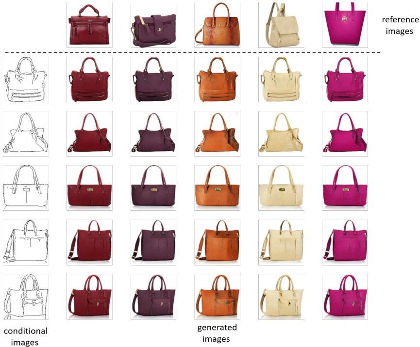
Figure 1: Reference generation results for edges \rightarrow handbag photos .

In this supplementary material we include generation results for segmentations \rightarrow building facades and edges \rightarrow shoe photos in the paper. Here we demonstrate more generation results for the rest of tasks.