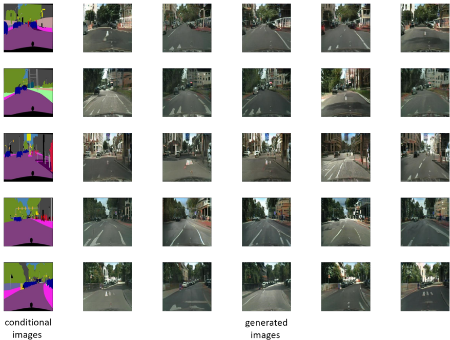
Figure 6: Random generation results for segmentations \rightarrow street photos .