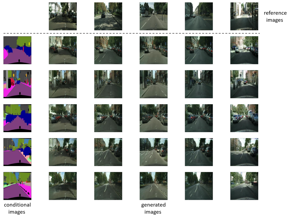
Figure 5: Reference generation results for segmentations \rightarrow street photos .