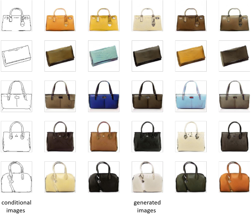
Figure 2: Random generation results for edges \rightarrow handbag photos .